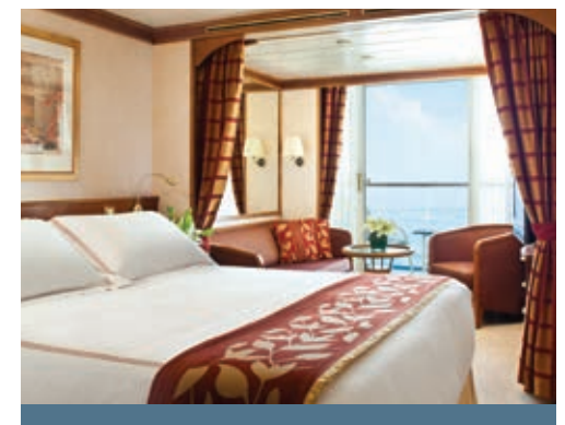
CONCIERGE SUITE CATEGORY D-E DELUXE SUITE CATEGORY F-H 301 SQ. FT. (Suite: 252 sq. ft. | Balcony: 49 sq. ft.)